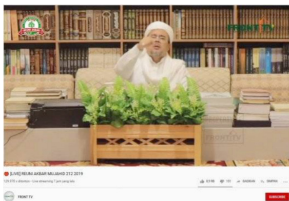
Picture 4. Habib Rizieq Shihab in Front TV YouTube account conducted a speech during 212 Reunion in 2019

During his exile, Rizieq Shihab met many visitors, usually political figures from Indonesia. Apart from that, he utilized YouTube to propagate his ideas and maintain the connection with his followers in Indonesia. From the account managed by FPI, Rizieq Shihab often contradicted the claim of the government in regard to social and political issues in Indonesia. The channels thus became the stage for Rizieq to maintain the political influence of FPI and himself beyond the borders of Indonesia. YouTube, the digital platform in this aspect, is utilized as the last straw to perform populism until his return to Indonesia.