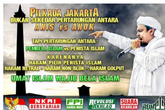
Picture 3. A meme that depicts Rizieq emphasizes the obligation of Muslims not to vote for Ahok (Purnamasari, 2016)

memes, and clips on streaming services such as Youtube. Such presentation was amplified in the following months during the legal investigation of Ahok as well as the gubernatorial elections.